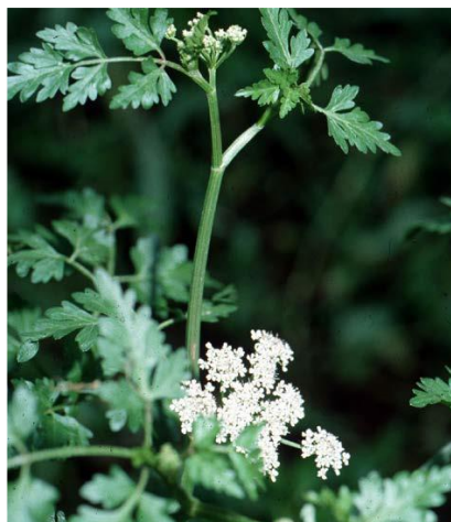
Oenanthe conioidea (Schierlingswasserfenchel)

Due to periodic inundations, permanent redistributions of sediments and wave strains, intertidal flats are suited to be priority areas for nature and species conservation. As the borderland between land and the sea, they provide an ecological niche and hence habitat for many rare and often highly specialised plant and animal species. A large part of the intertidal flats cannot be used directly by man and is left undisturbed for longer time periods.