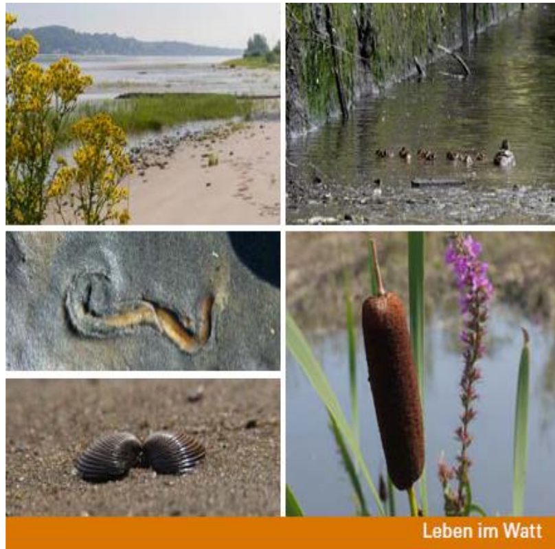
Live on the intertidal flats

Plants and soil organisms on the intertidal flats are subject to permanent alternation of falling dry and flooding, erosion and deposition of sediments, fluctuations of the water and soil temperatures, and are exposed to currents and waves. During low tide, they are affected by sun, wind and rain, during high tide they are translocated by the water current. In addition, the salt content of the intertidal soil significantly determines the colonisation by soil organisms and plants. The salt concentration in soils of marine intertidal flats, is about 35 grams per litre soil water, while in the fluvial area it is about 0.5 grams per litre only. While one may believe these extreme conditions are hostile to life, intertidal flats are actually quite species-rich.