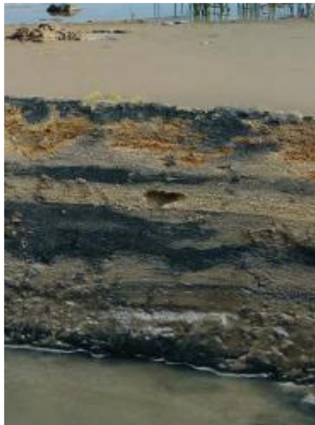
Sand estuarine tidal flat soils, Neßsand